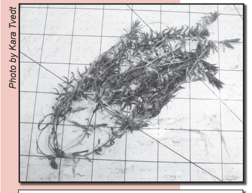
A young hydrilla plant.

Don't forget to send your questions to streamteam@mdc.mo.gov or call 1-800-781-1989.