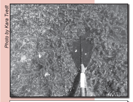
Hydrilla impeding navigation during late summer months.